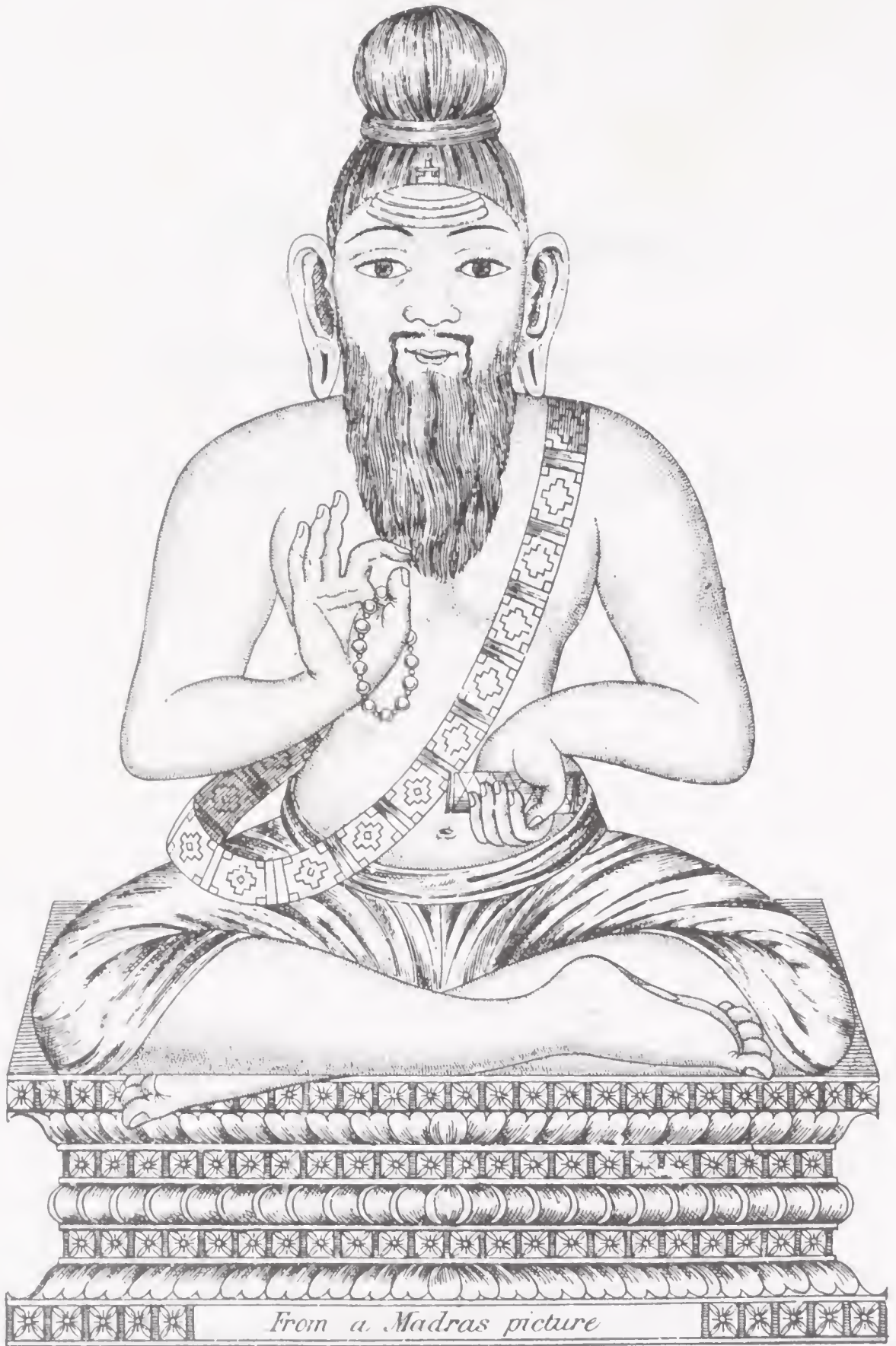
From a Madras picture